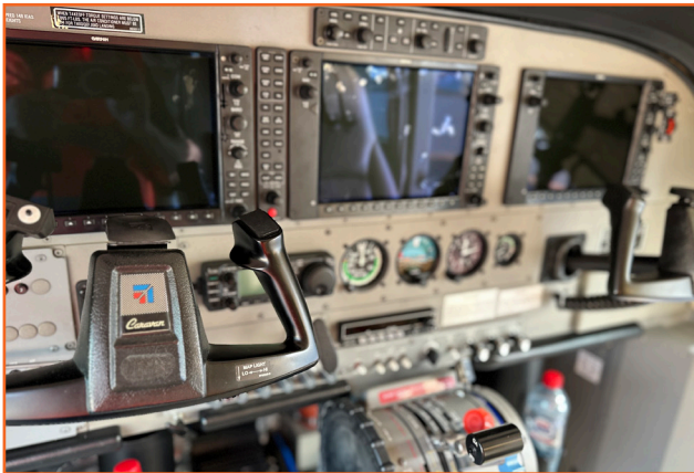
G1000 Avionics Suite