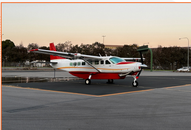
White with Red, Orange and Yellow Accents