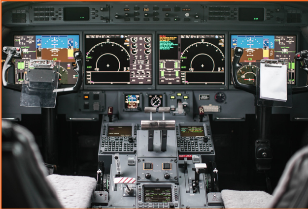
Honeywell Primus Epic Avionics Suite