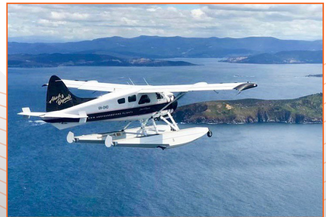
White with Black, Blue and Orange Accents