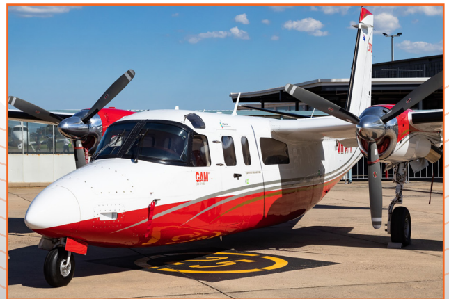
White with Red and Silver Accents