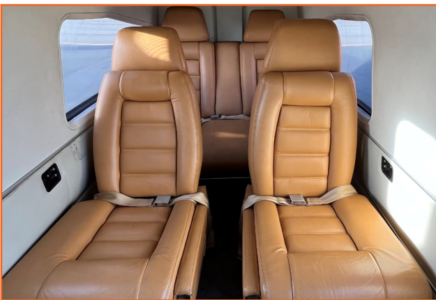
Tan Leather Commuter Interior