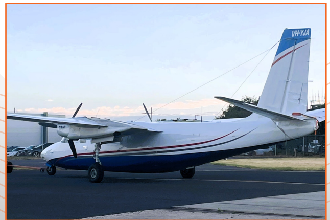
White with Blue and Red Accents