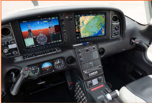
Cirrus Perspective™ by Garmin® Avionics Suite