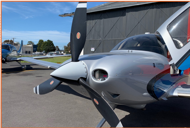
Hartzell 3 Blade Comp Propeller