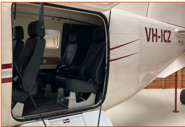
Cabin Door with Integral Steps