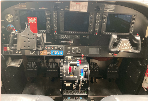
Garmin G1000 Integrated Avionics Suite

Disclaimer - Errors and omissions excepted. Buyer inspection recommended.