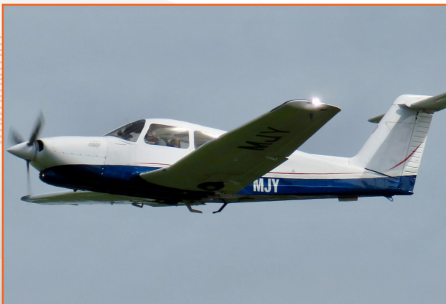
New Paint 2023