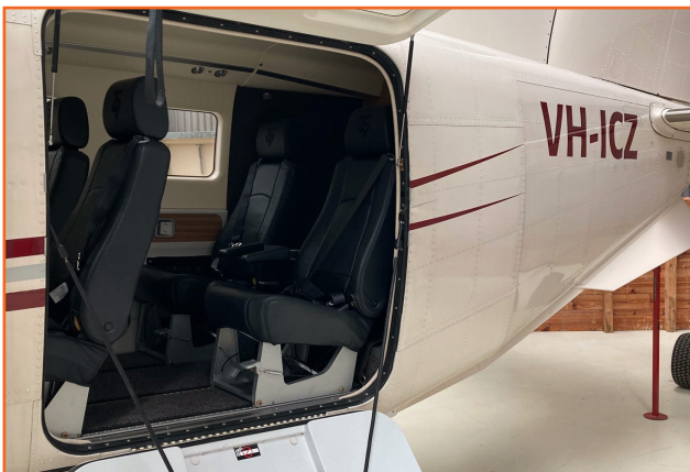
Cabin Door with Integral Steps