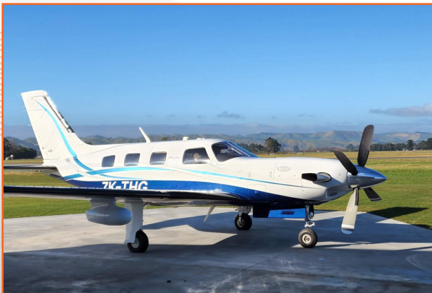
White and Marlin Blue with Midnight Blue Trim